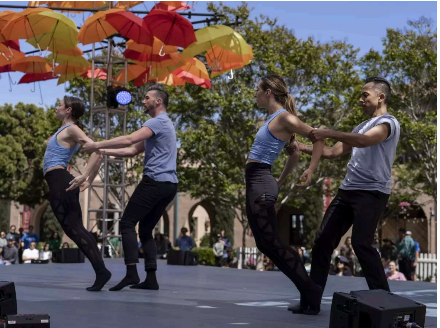
Dancers with San Diego's Malashock Dance perform "Swells" at last month's Without Walls Festival at Arts District Liberty Station.

After more than 30 years, Malashock Dance company has begun a campaign to find a new artistic director while it continues to evolve with its strong legacy of performance and service to the community.