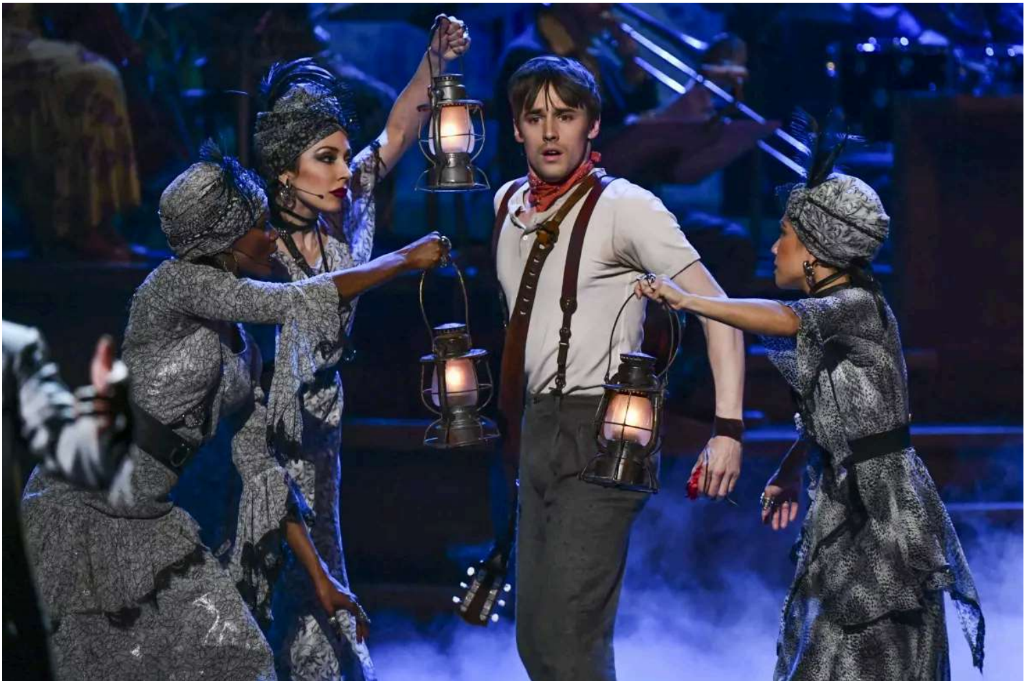
Reeve Carney, of the cast of “Hadestown” performs at the 73rd annual Tony Awards at Radio City Music Hall on Sunday, June 9, 2019, in New York.