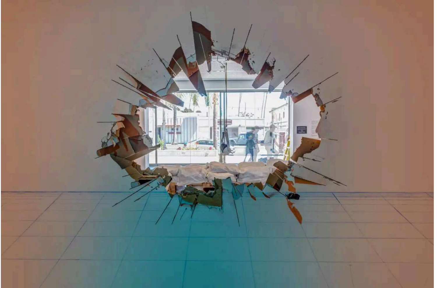
Tijuana-based artist Shinpei Takeda's current exhibition at the Oceanside Museum of Art titled "Limit Of Your Safe Space."

Tijuana-based artist Shinpei Takeda's current exhibition at the Oceanside Museum of Art is not so much about the safe space we all crave sometimes but those spaces' limitations.