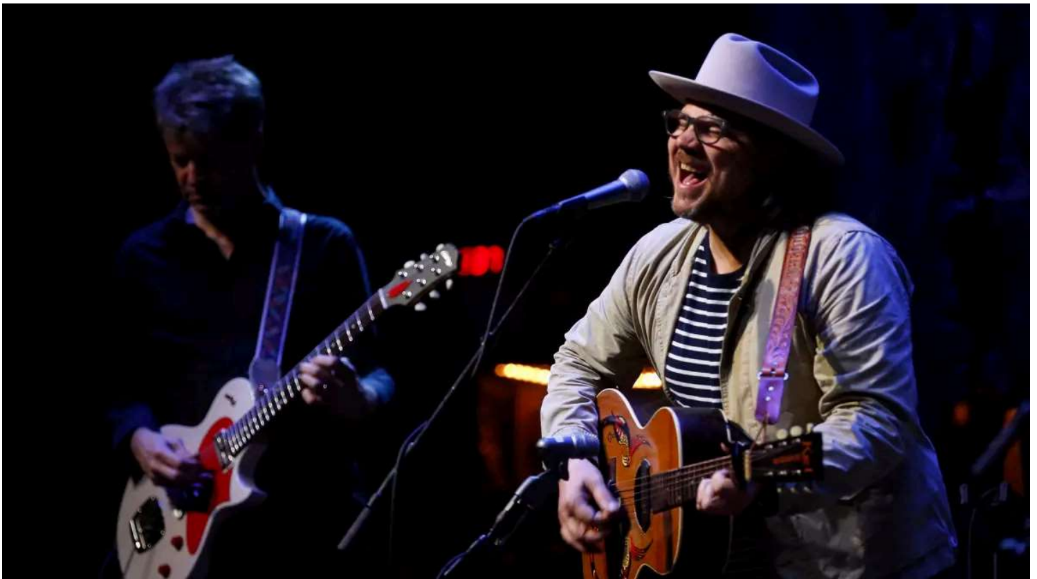
Wilco’s Nels Cline, left, and Jeff Tweedy