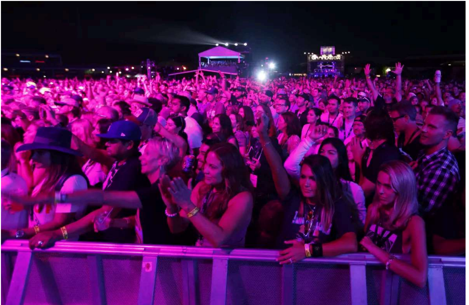
Fans watch the Wu-Tang Clan at KAABOO Del Mar on Sept. 13, 2019.

The saga of the dormant KAABOO music festival has taken a new twist, with lawsuits in San Diego and Delaware that pit the event’s new owners — whose identity appears to be