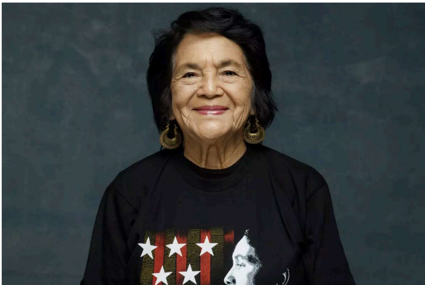
Activist Dolores Huerta

University of California Television invites you to enjoy this special selection of programs from throughout the University of California. Descriptions courtesy of and text written by UCTV staff: